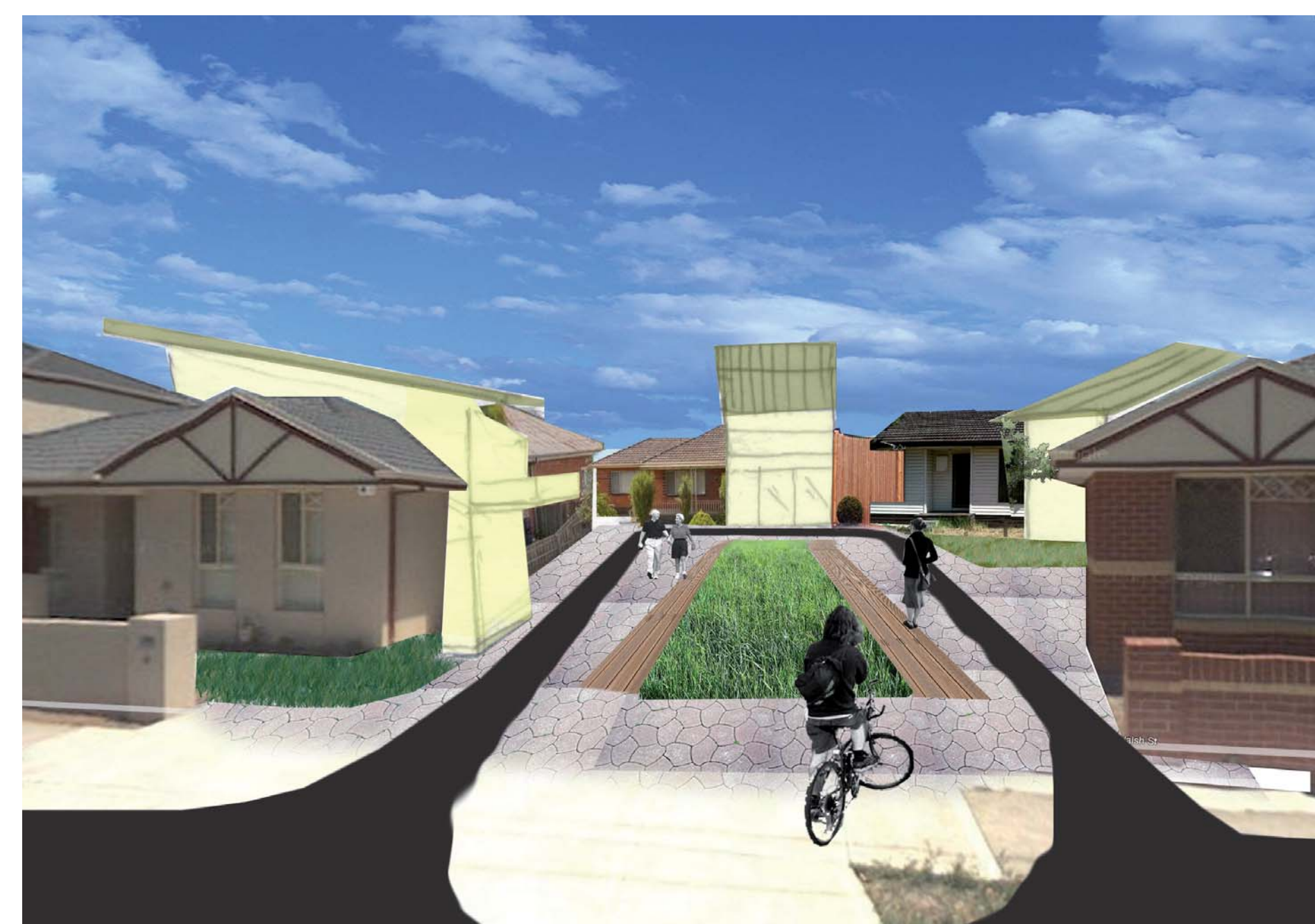
perspective view of the entrance

central courtyard increase the circulation within the housing stock